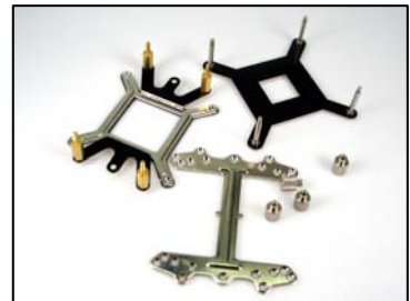
Universal Clip Design