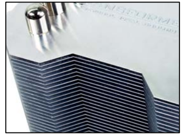
High Density Fin