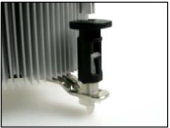
Push Pin Design